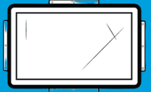
Fingerprint & Scratch Resistant